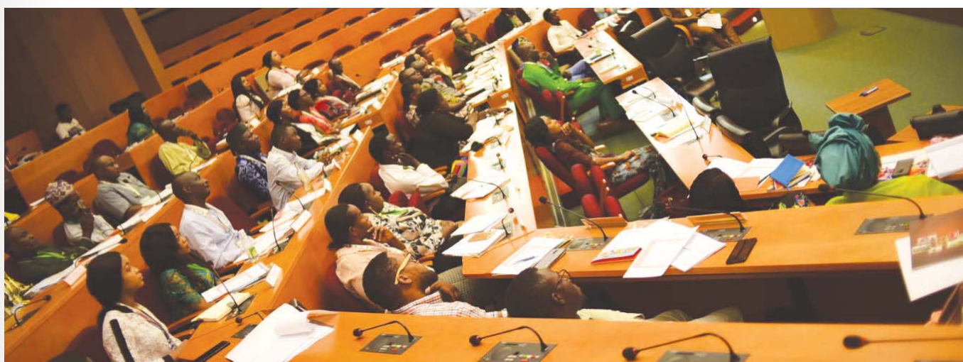
Cross Section of Participants at the 2019 NGO Training