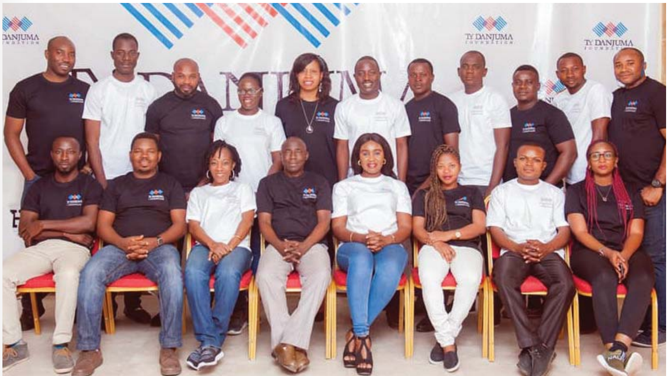
TYDF Staff After the 2019 Retreat

At the beginning of the year, the Foundation organised a retreat for its staff. Those in Taraba and Edo State offices joined the Abuja office at a location for the yearly ritual. Activities in the retreat include team building, year work planning, setting work objectives, appreciation of job done, and review of lessons learned from the previous year. The retreat this year ended with a movie at the cinema.