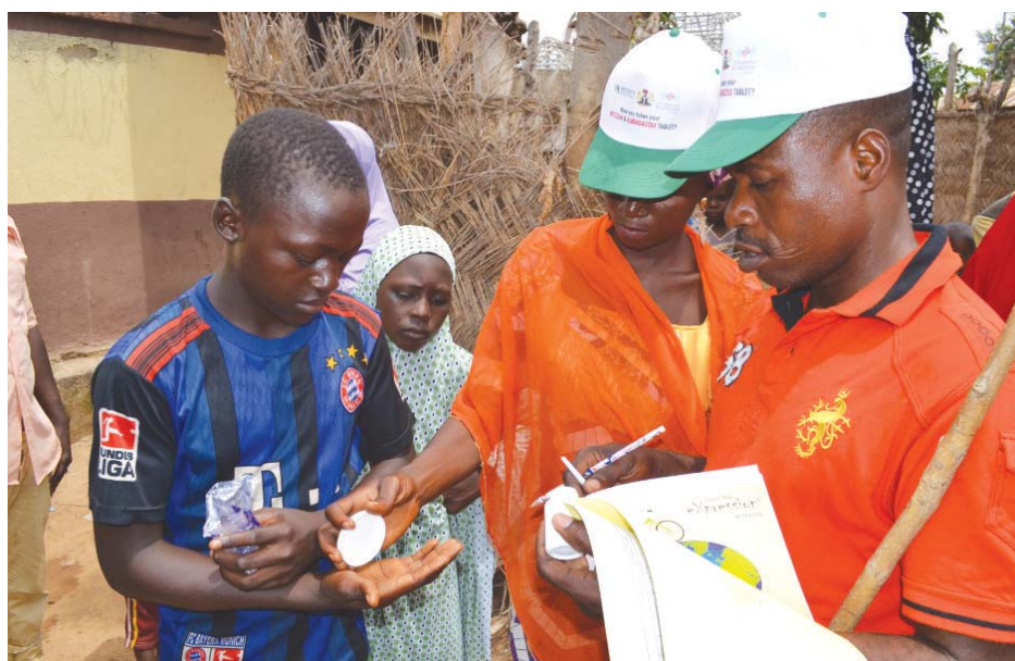
Mass Administration of Mectizan for the Prevention of NTDs